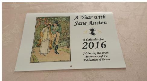
Above: Jane's profile wristlet $20.00. Book page wristlet $25.00. Below: Calendar $11.00.